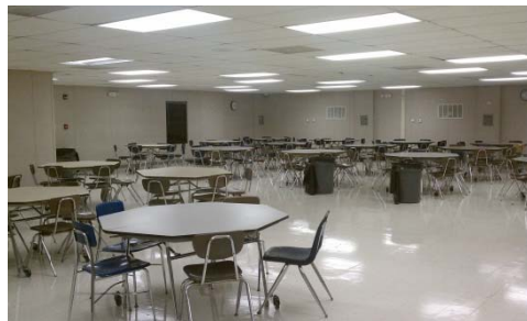
Figure 2 (above) temporary cafeteria (below) portable classroom.